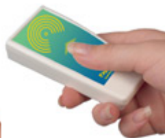
Smart Handheld 9110.236