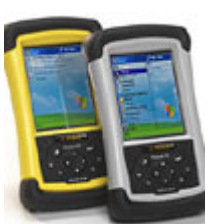
WIN CE Handheld