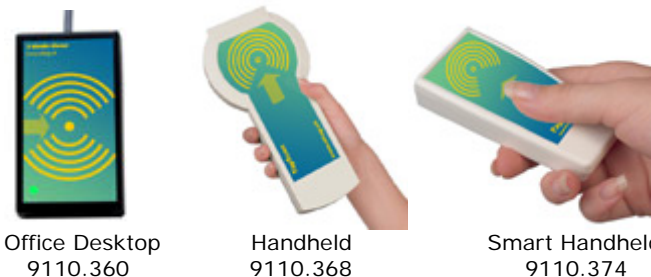
Office Desktop 9110.360